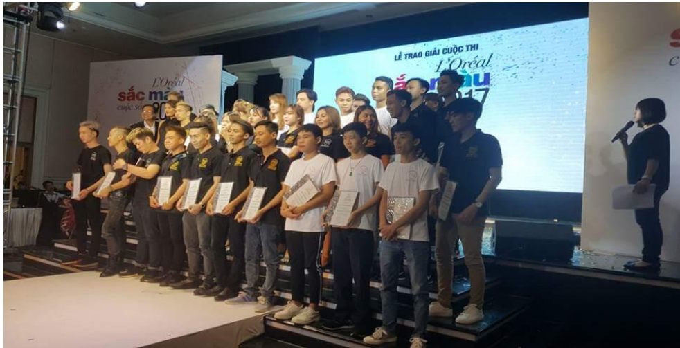
Graduation Ceremony held by the L'Oréal Vietnam for new graduates