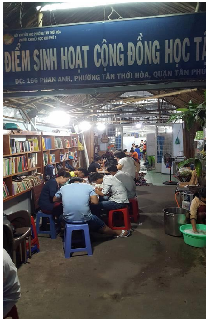
Non-formal education night class is on for illiterate adults and children at our Loving Class