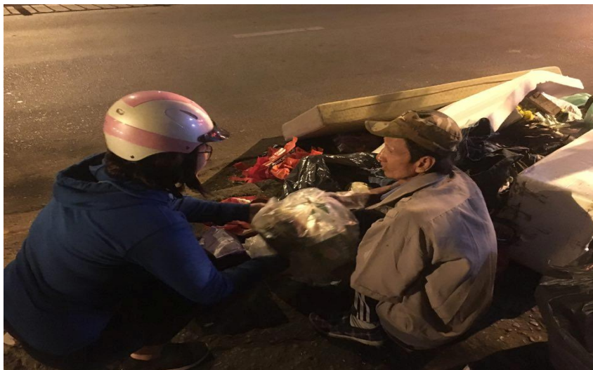
Lunar New Year gift handed in to a scavenger by a TỪ HÒA-CICG member

Delivery of 110 loving gifts [each including a square glutinous rice cake (called Bánh Chung, 1 kilogram heavy), 8 small boxes of Vina milk and a large biscuit box worth 120,000 VNDs (7 AUDs/each)], had not been completed until over 02:00 am of the next day. Twenty young volunteers and members of TỪ HÒA-CICG said goodbye to one another, and returned home ready for a new day, whereas those who are homeless and familyless, have still been sleeping in temporary and rough shelters under the city bridges or beneath the eaves of houses along streets etc on the cold night of Sai Gon right before the Tet Holidays. (All gifts cost over 13 million VNDs)