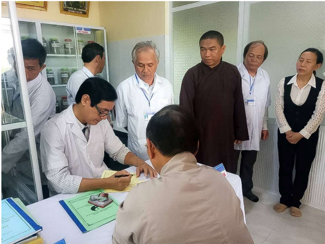
Herbal doctors are examining and treating patients on the open day of Quang Tri Thien Lanh Oriental Therapy Clinic of 19 patient beds in Quang Tri province, Central Vietnam.

For the past years, this massive set of resources has seemingly been forgotten about or only used to a small degree. However, thanks to the collaboration of multiple parties, they are now being utilised to develop Thiện Lành Eastern Medical Centres within the communities. As we speak, in , Dong Thap, Ben Tre, Soc Trang, An Giang ,Da Nang, and Ha Noi, there are an adequate amount of the above resources to build and lay the foundation for traditional medical centres. TU HOA's diligent team of volunteers has worked with their fellow brothers and sisters in the west provinces of Southern Vietnam to prepare the masterplan for our construction of a professional Virtuous Eastern Medical Centre (or Thiện Lành Eastern Medical Centre). An average fund of 18,000AUDs (14,000 USDs) is necessary to construct the Centre and supply